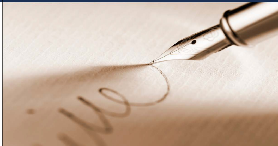
Stefano Domenicali Chairman & Chief Executive Officer

With our actions, in fact, we are all crucial part of the Company's business, in order to safeguard its reputation and trust in every situation.