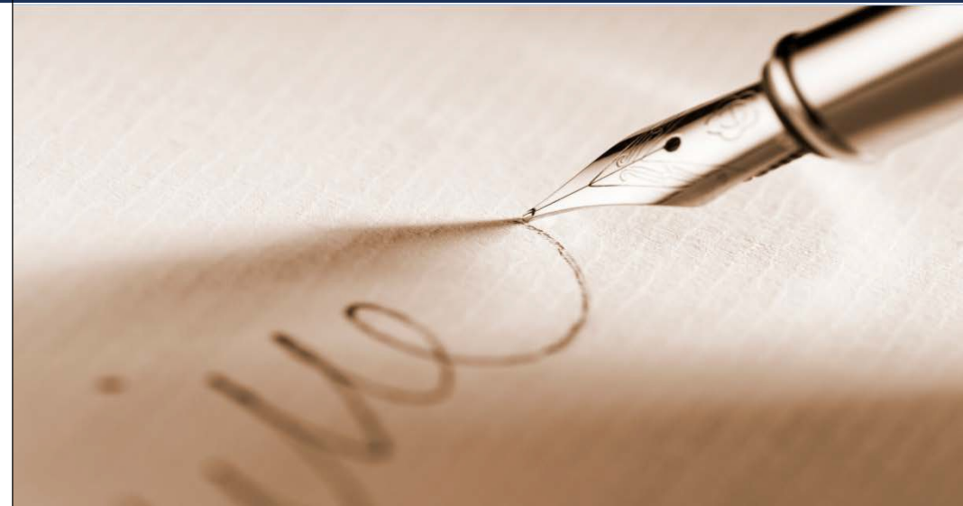
Matthias Müller Chairman of the Board of Management of Volkswagen AG

We, the Board of Management of the Volkswagen Group, are convinced that our Code of Conduct is an essential key to making the Volkswagen Group and its brands even more successful in the future. The clear and transparent rules and very specific practical examples are a useful guide. We therefore encourage you to read the contents carefully. And we hope you will join us in working together to make the Volkswagen Group a byword not only for excellent products and services, but also increasingly for integrity and fairness